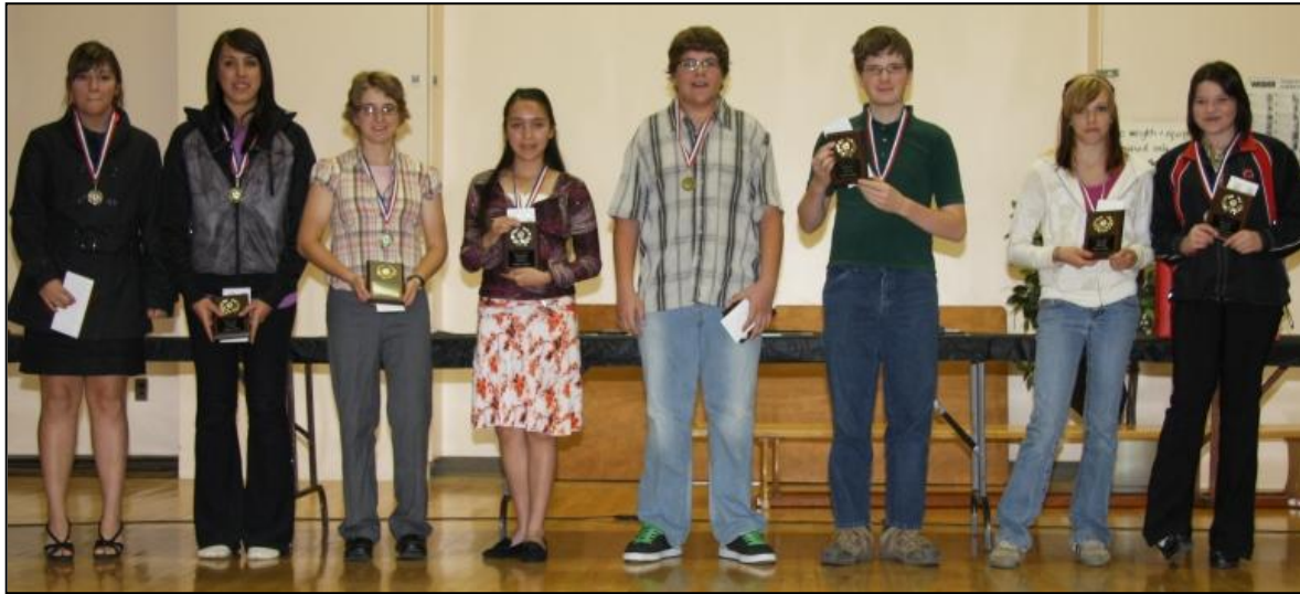
Above: Honours List winners