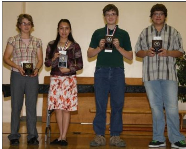
Right: Highest Academic Award winners in grades 7 through 11