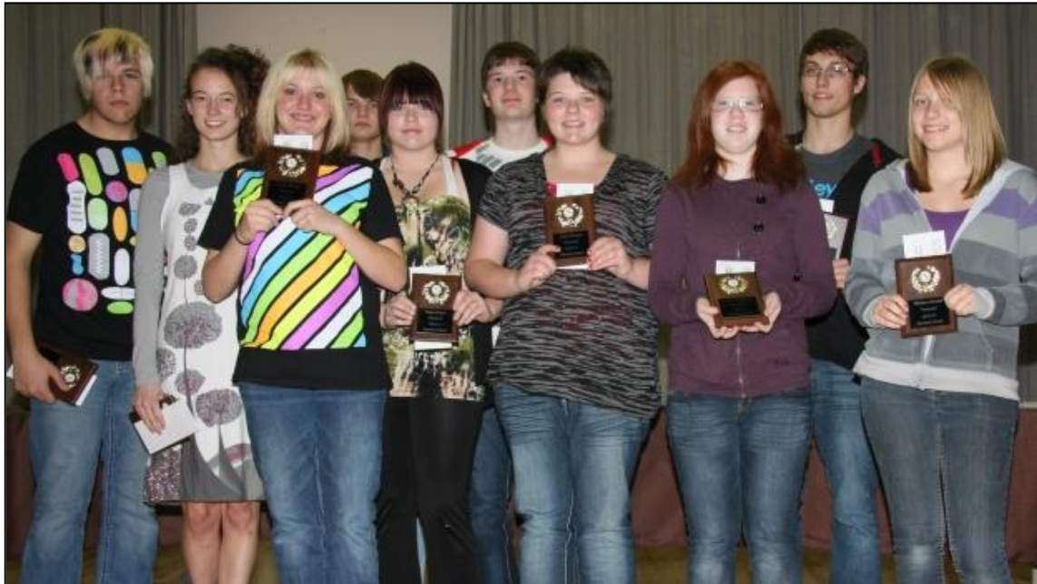
Honours List Award winners